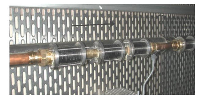
Fig. 4: Temperature cycling test

These include monolithic, short and long-fiber-reinforced extrusion and injection molding techniques, various types of back-injected inserts, fabric structures and other designs.