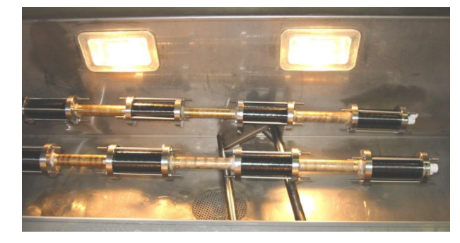
Fig. 3: Pressure cycling test

Before the mass production launch of FWH separating cans in hot-water wet rotor pumps in 2004, extensive systematic tests were carried out on plastic separating cans. In addition to static short-term pressure tests, numerous long-term studies were carried out on various types of plastic separating cans.