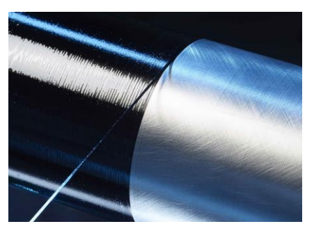
Fig. 2: FilaWin® - CF roving placement

Before the mass production launch of FWH separating cans in hot-water wet rotor pumps in 2004, extensive systematic tests were carried out on plastic separating cans. In addition to static short-term pressure tests, numerous long-term studies were carried out on various types of plastic separating cans.